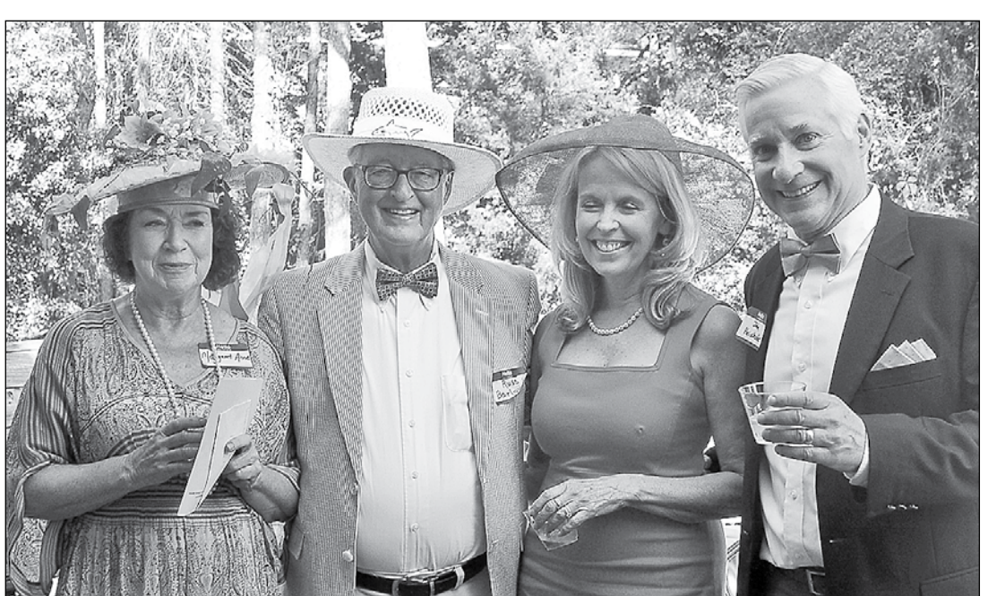
Guests dressed their best for the garden-style party that raised money for preservation and restoration of the rifle range pit built in 1918.

More than 50 people came out to support Friends of Fort Caswell Rifle Range Inc. Saturday during a Kentucky Derby-themed event at the Caswell Dunes clubhouse. The circa-1918 rifle pit is one of the few left standing in the country, and is a stark reminder of the sacrifices American soldiers made going to Europe to fight in the Great War. Used for training, the historic structure is in need of reinforcement and repairs. It was once part of the larger Fort Caswell complex. Attendees, dressed in their finest hats and garden party attire, bet on tabletop races and the derby and enjoyed a catered meal. Local merchants and restaurants donated items for the silent auction. Organizers also had notecards, prints, magnets and puzzles depicting the rifle pit.