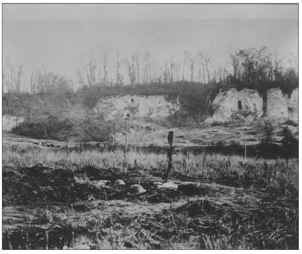
Partial view of after the battle the to secure Hindenburg Line