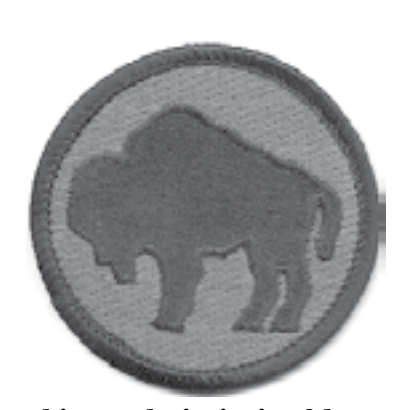
This was the insignia of the all-black 92nd Division of the 365th Infantry, whose members served in World War I. The men called themselves the "Buffalo Soldiers" in honor of the African-American unit that served in the West during the Civil War.