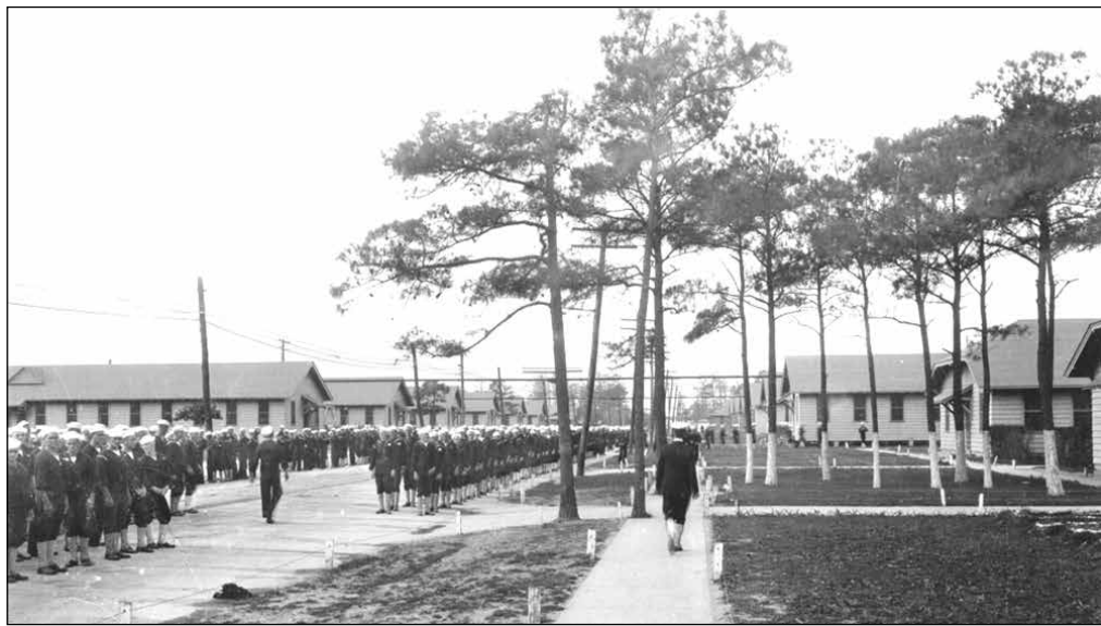
Navy sailors in formation on Gilbert Street.