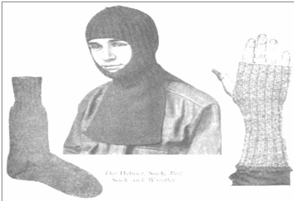
Red Cross knitted items, knitting directions for the Red Cross packages were published in magazines and books, such as "The Delineator," July 1917, p. 37.