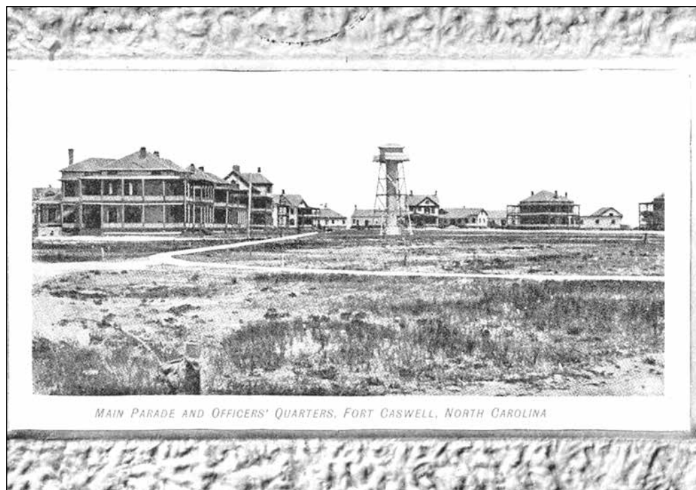
Ft. Caswell Parade Ground and Officers Quarters.